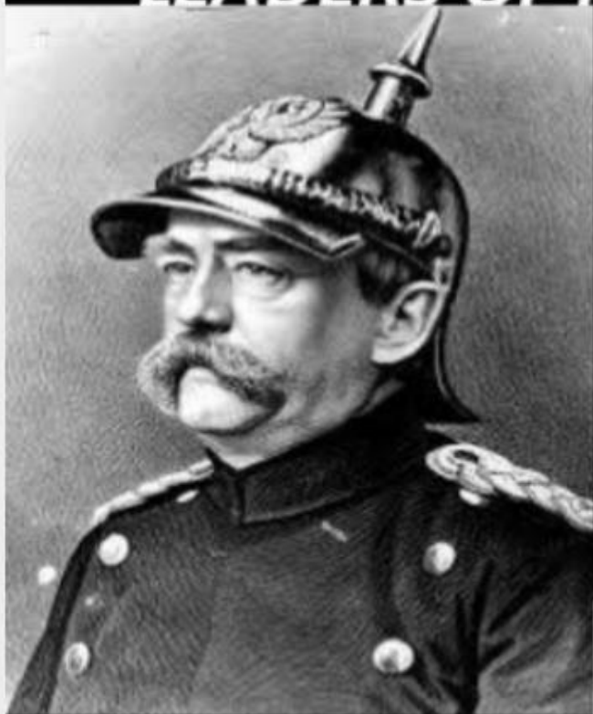
OTTO VON BISMARCK