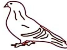
कबूतर Kabootar (Pigeon)