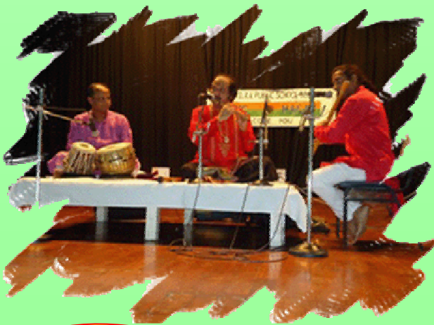
Shri Majumdar giving a mesmerizing performance