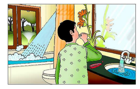
WASTAGE OF WATER DURING DOMESTIC ACTIVITIES