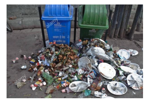
THROWING GARBAGE OUTSIDE THE BIN